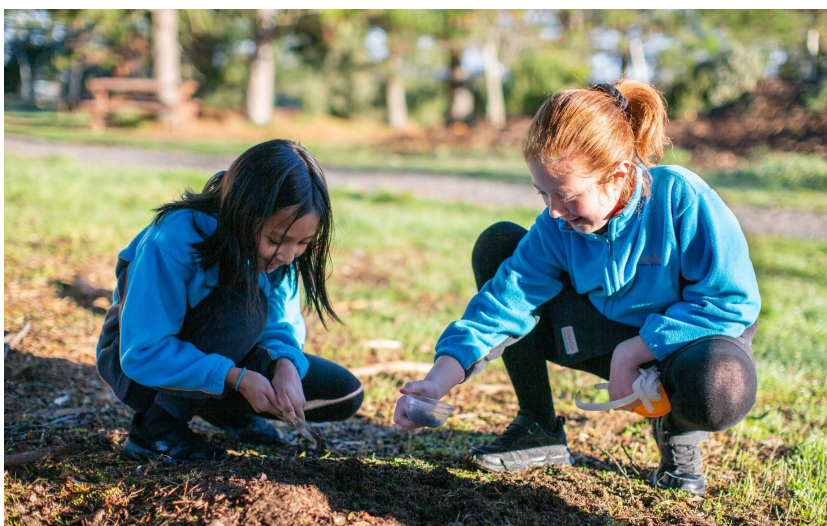
TP collecting soil samples to observe mesofauna activity.