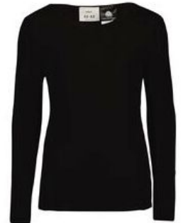
H&H Kids' Merino Long Sleeve Thermal Top