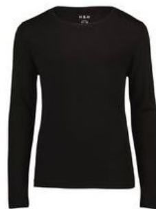
H&H Kids' Polyester Viscose Long Sleeve