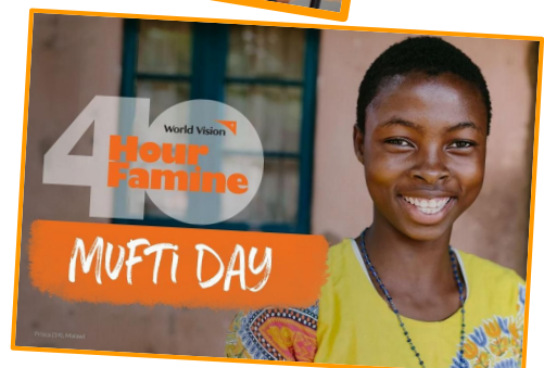
Why we do this