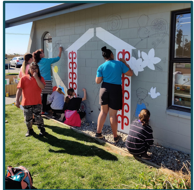
Above: Cultural Mural being started.

Please remember we require all students to wear school hats during Term 4. All students should continue to wear full school uniform, including correct polar fleece, and polo top. All non-regulation uniform requires a note from home.